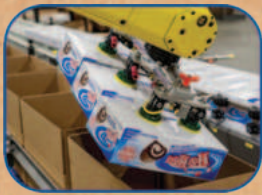
End-of-line packaging machines