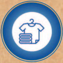
Garments & Textile