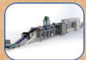
Secondary packaging machines