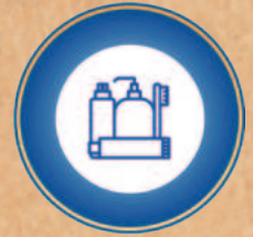
Personal care products