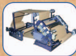
Corrugated box making machine