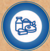
Dairy & meat