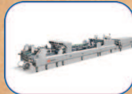
Carton folder gluer machines