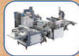
ConvRigid box making machines