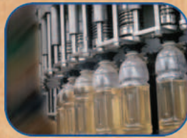
Filling and bottling machines