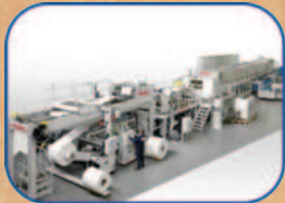
Paper converting machines