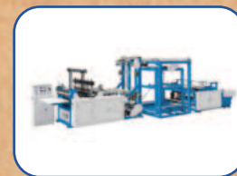
Non-woven machines and products