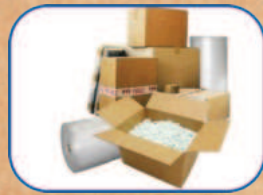
Packaging raw material