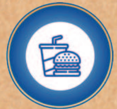
Food and beverages