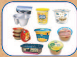
Finished rigid packaging