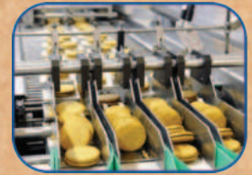
Food processing machines