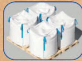
Bulk packaging solutions