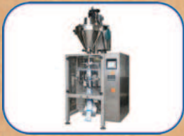
FFS packaging machines

Showcase your cutting-edge, market-leading solutions to thousands of buyers eager to source the latest innovations that can enhance their packaging capabilities. PackPlus is the must-attend event for manufacturers, distributors, dealers, and suppliers ready to showcase solutions that shape the future of packaging. Don't miss the chance to connect with a highly engaged audience eager to discover what your products can bring to their business.