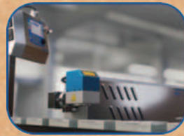
Coding and marking