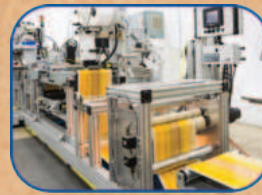
Flexible packaging converting machines